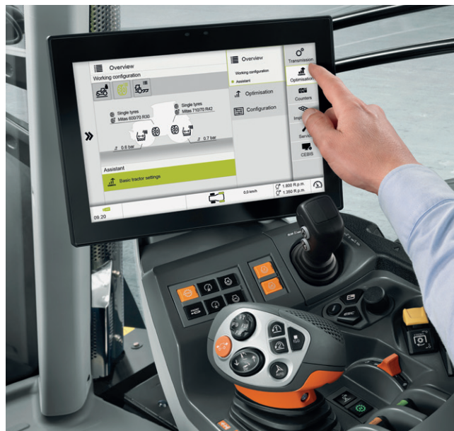
Figure 2: The CEMOS user interface on the CEBIS operator terminal

CLAAS CEMOS TRACTOR is a driver assistance feature that is integrated in the CEBIS operator terminal and is available for all CLAAS ARION and AXION tractors. As a first step, the system asks the operator to enter various parameters including soil moisture and soil type, working depth and implement data. The specific tyres fitted are also logged to the software. The system uses the information to compute suggestions on the proper ballast weight in the front linkage, rear linkage or on the wheels. After that, the operator enters the actual ballast weight. Any disparity between actual ballasting and the suggested weight (for example the absence of a specific front weight) is taken into account by the system as it guides the operator through the optimising dialogue and computes the ideal tyre pressure. This optimising dialogue can be carried out on the move and at any time. CEMOS for tractors also helps operators increase the efficiency of the combination, aiming at maximising either ha/hr performance or fuel efficiency. Either way, the system ascertains the current set-up in a first step and then takes the operator through a series of various suggestions on optimising acreage or fuel efficiency. The outcome of the changes – whether positive or negative – is displayed immediately for the operator to confirm the new settings or resume the previous settings.