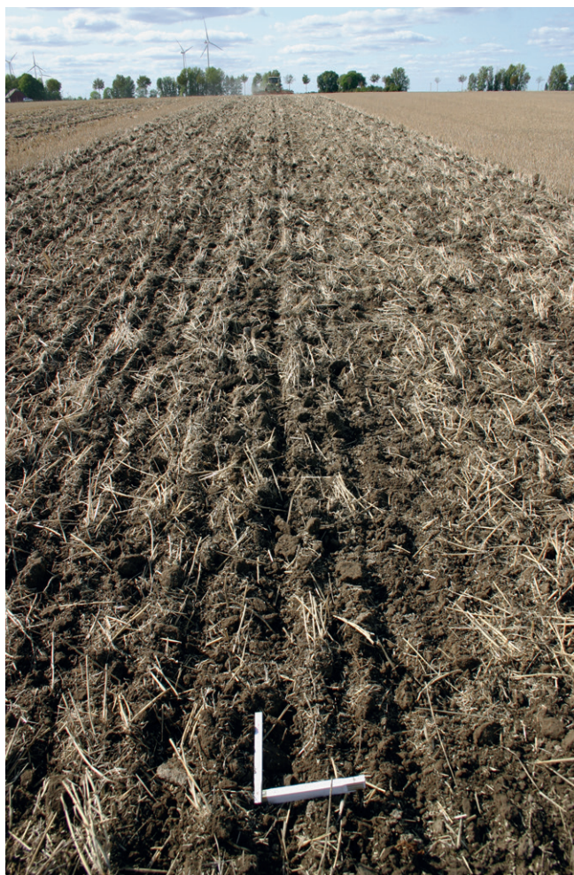
Figure 4: The quality of work in a stubble field after working 14cm deep and using the driver assistance system.

Aiming at operating as fuel-efficiently as possible, 8 out of 10 test drivers were able to increase their work rates in cultivation by using the CLAAS CEMOS assistance system. In two cases, the assistance system suggested a lower forward speed than what had been selected by the test drivers. This led to a reduction in both ha/hr performance and fuel consumption. With the results all 10 testers averaged, the assistance system proved to increase the area output by 5.6% over the test runs without the assistance system. When assessing the performance of each individual operator, the maximum increase was 16.3%, which was achieved by increasing forward speed from 6.8km/h to 7.9km/h as suggested by the assistance system. The CLAAS CEMOS assistance system had a clearly more positive effect on the work rate in the deep cultivation passes where acreage increased between 3.2% and 16.3% as compared with the shallow work where the increase was between 1.3% and 3.2%.